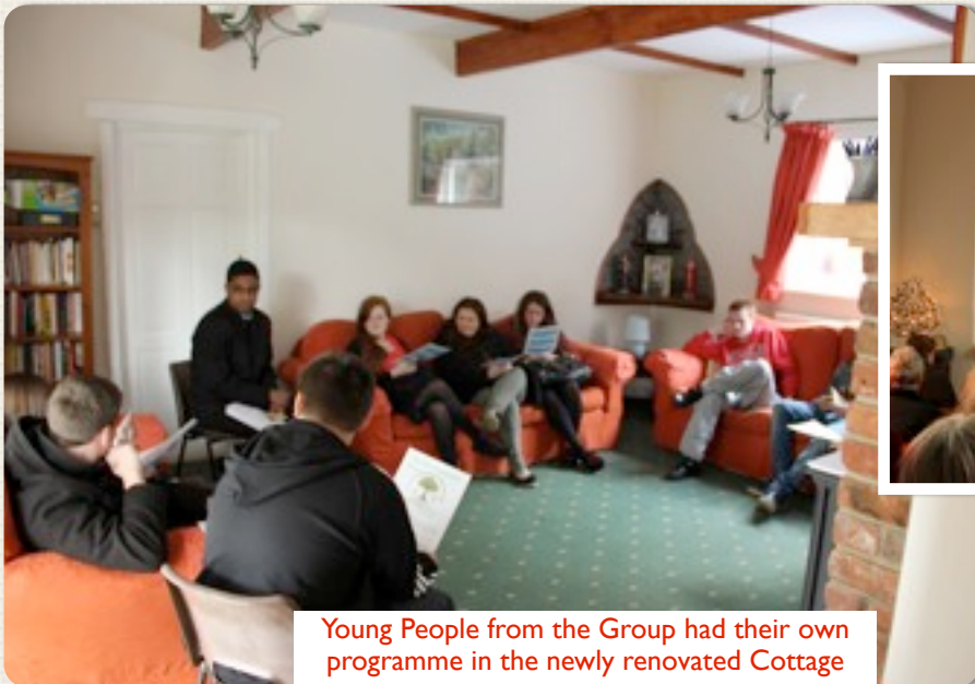
Young People from the Group had their own programme in the newly renovated Cottage