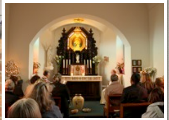
VISITORS FROM ST KENTIGERN & ST EDWARD'S PARISH FOR THE FIRST PARISH SHRINE DAY