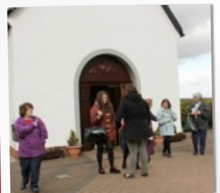
GETTING TO KNOW YOU